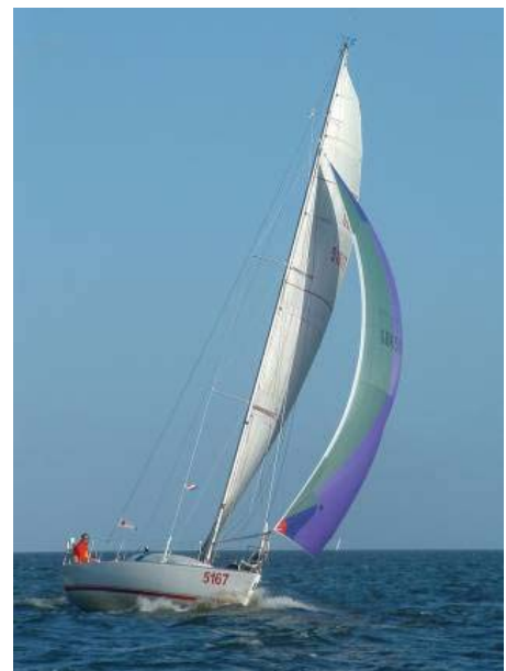
One of the JOD35s entered

Also we will be bearing in mind that the race week is being held during some pretty high spring tides and the last thing we want to see is boats struggling to finish against some strong tides especially at St Peter Port and Treguier finishes. On these legs you will need to keep up an average of over 5.5 knots to beat finishing in foul tide at the end.