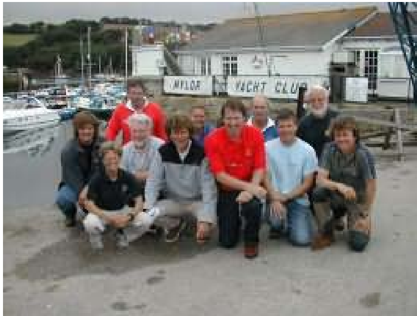
* indicates OSTAR 2005 entrants